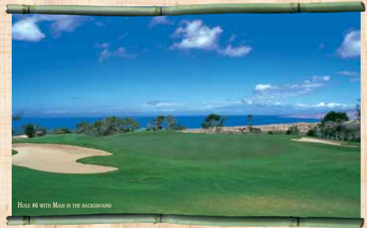
HOLE #6 WITH MAUI IN THE BACKGROUND

South Kohala Coast • 68-1792 Melia Street • P.O. BOX 383910 Waikoloa, Hawaii 96738 • (808) 883-9621 • www.waikoloavillagegolf.com